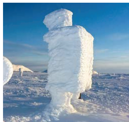
Winter view of the above installation.*