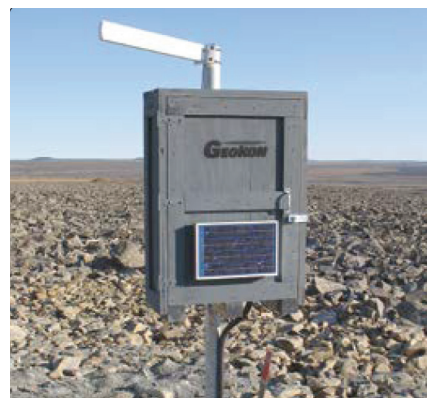
Summer view of the GEOKON Model 8025 Data Acquisition Station measuring a 70m deep Thermistor String in mine tailings, located in northern Canada.*

*The number of sensors that can be supported depends on the overall length of the cable. Please contact GEOKON® for details.