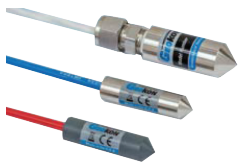
Model 3800-1-1, Model 3800-2-1 and Model 3800HT Thermistor Probes.