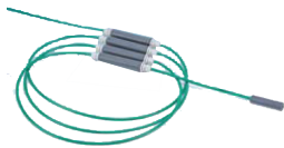
Model 3810A Addressable Thermistor String, shown with 4 sensors.