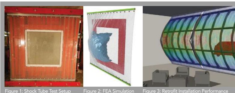
Figure 1: Shock Tube Test Setup

Analysis of University of Ottawa Shock Tube Test for window blast (Fig. 1) closely matches results of Finite Element Analysis simulation (Fig. 2), modeling the behavior of GuardianCoil for peak displacement and other critical performance factors. Results applied to predictive modeling and analysis for retrofit building installation (Fig. 3) illustrate the ability to withstand an exterior truck bomb explosion.