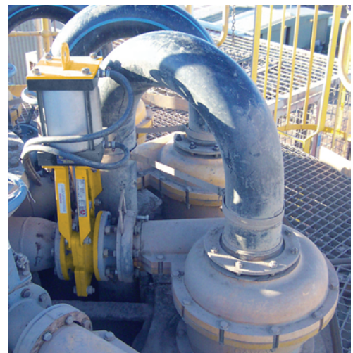
Cyclone Isolation Valve