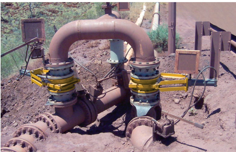
Tails Line Valves with Hydraulic Actuators