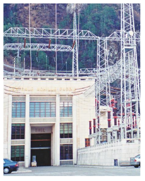
Hydro-Electric Power Station -ENEL, North Italy