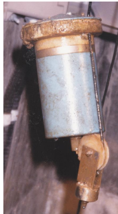
ID-221 Detector: Dirty but Operational