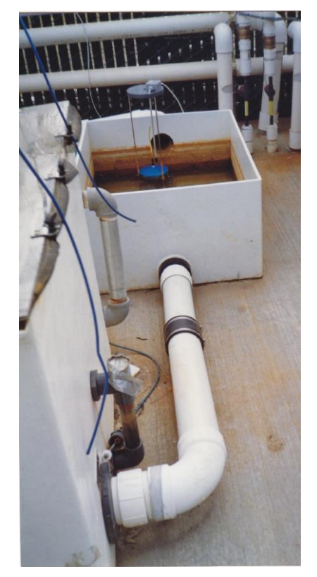
ID-223/500 in a Settling Tank