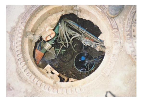
ID-221 Monitoring in a Tank

An ID-221 Detector, installed in wells for remote monitoring after remediation, may reduce the high cost of consultants and technicians who are required to monitor these wells, taking numerous manual samples, for a substantial time before the authorities accept that the remediation is complete.